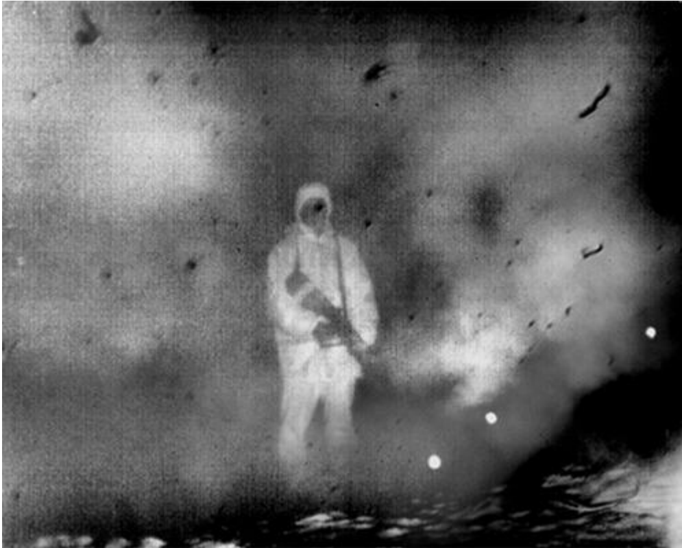
Figure D: To the human eye, the person is invisible. A SWIR camera sees through darkness and smoke.