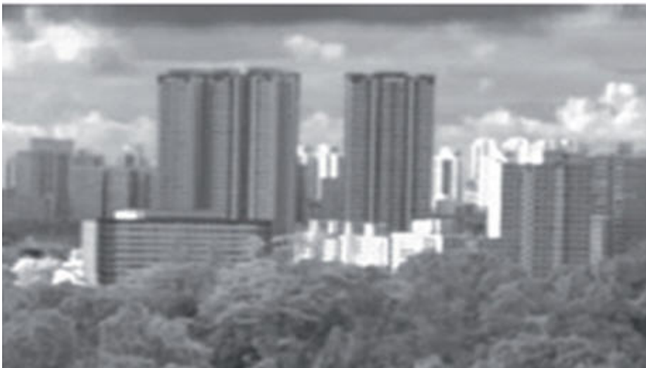
Figure A: in the visible spectrum, haze and fog are marring the view (top). SWIR cameras see through haze and fog (bottom).