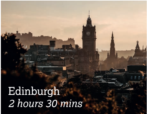
Edinburgh 2 hours 30 mins