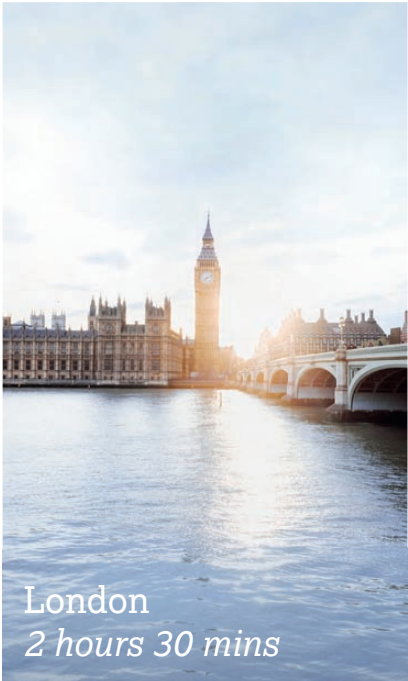
London 2 hours 30 mins