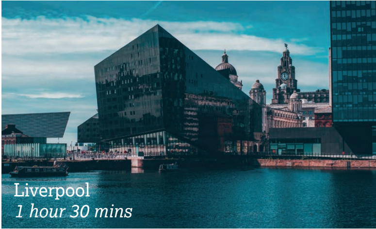
Liverpool 1 hour 30 mins