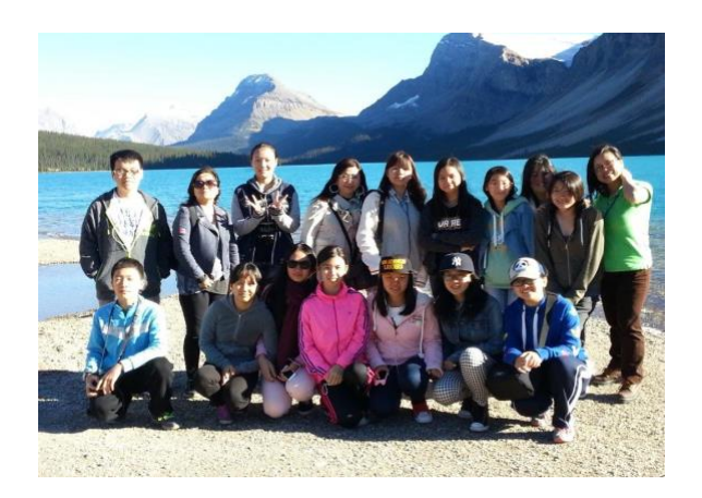
A 4-day Rockies trip