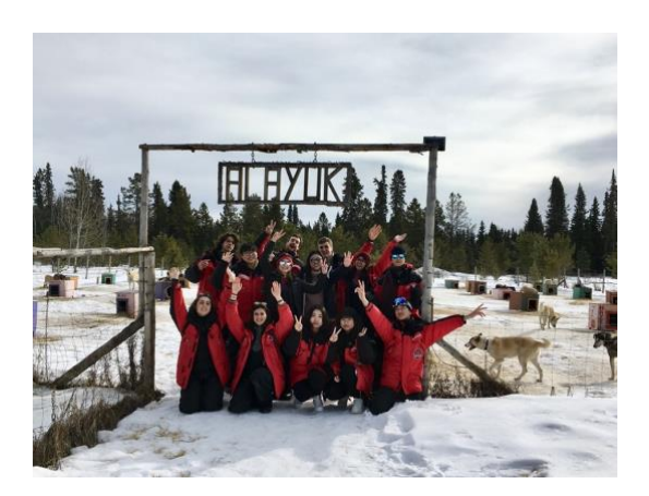
A 3-day Yukon trip