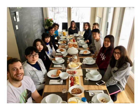
Breakfast time, Yukon